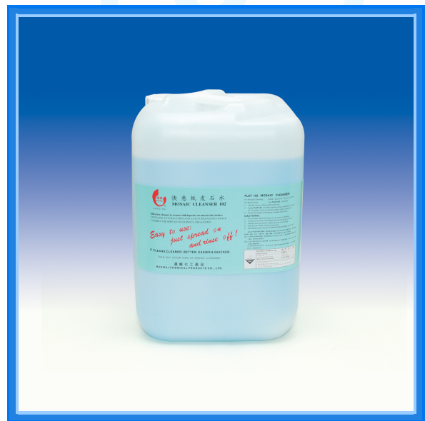
20 公升膠桶裝 Twenty Litres Packing