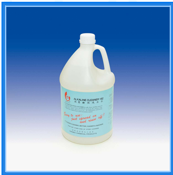
1 加侖膠樽裝 One Gallon Packing

本公司主要是生產及銷售工商業清潔劑產品。早於三十多年前在開始研製及銷售“快意洗石水產品系列”。在眾多洗石水中，“快意 182 鹼性洗石水”由於性質溫和，含環保性質，清洗後不影響石質及窗框表面，香港製造，質量保證，因此有很多大小型石磚去污清洗工程中也推薦“快意 182”為清洗工程清潔劑。直至現在，已有很多私人屋苑、房屋署、清潔公司、物業管理公司等各大小清洗工程中，已採用本公司之洗石水產品。